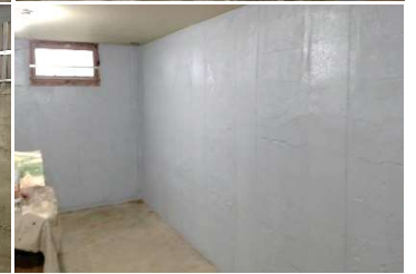
Residential foundation. Badly fractured and bowing wall