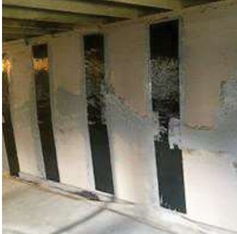
Wall reinforcing Bowling, cracked wall.