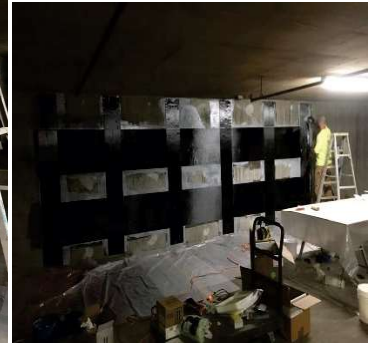
Commercial building foundation