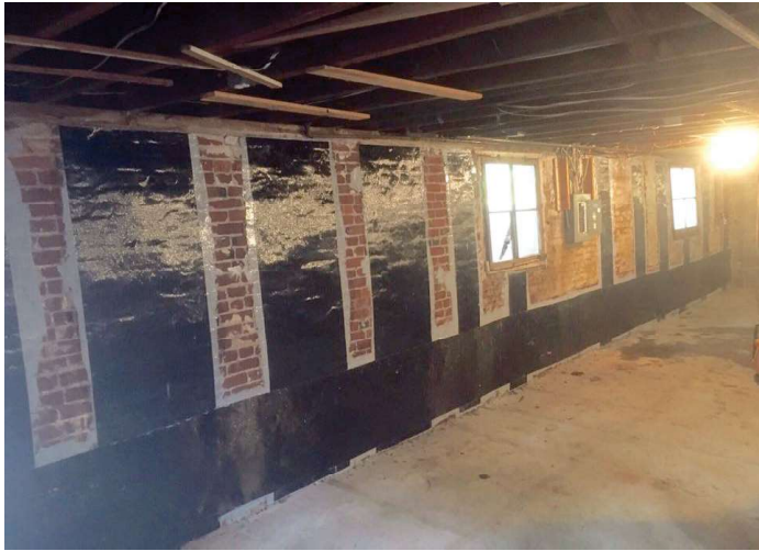
1890's era brick foundation

The integrity of your foundation is our specialty. Guaranteed.