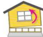
Overturning House Lifts Off Foundation