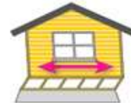
Racking Cripple Walls Buckle and Collapse