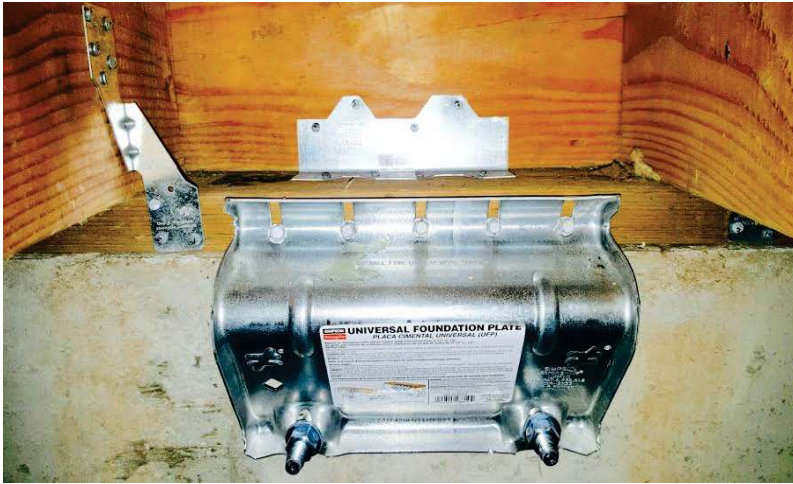
The three primary perimeter brackets.

The integrity of your foundation is our specialty. Guaranteed.