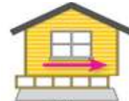
Sliding House Slides Off Foundation