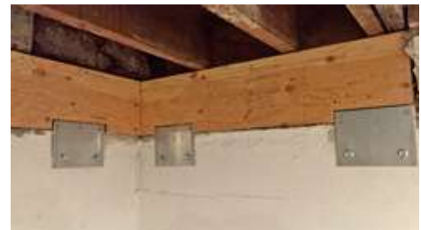
Cripple wall with plywood sheathing